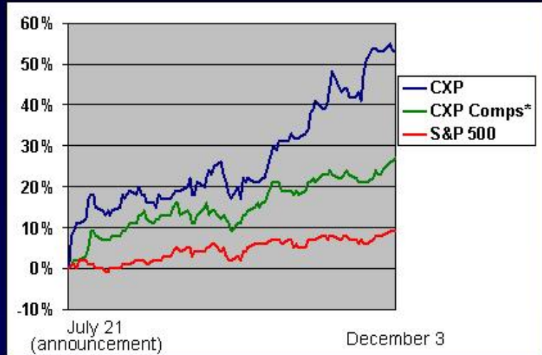
Price Performance Since Announcement